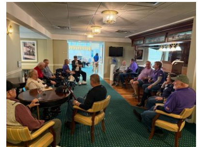
VFW Post 7234 Officers, Board Members and Honor Guard on a recent visit to Veterans at Brandywine Assisted Living